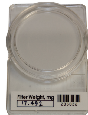
47 mm Filter Pre-weighed MW-47