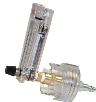
Total Particulate Test Module LP-47PF