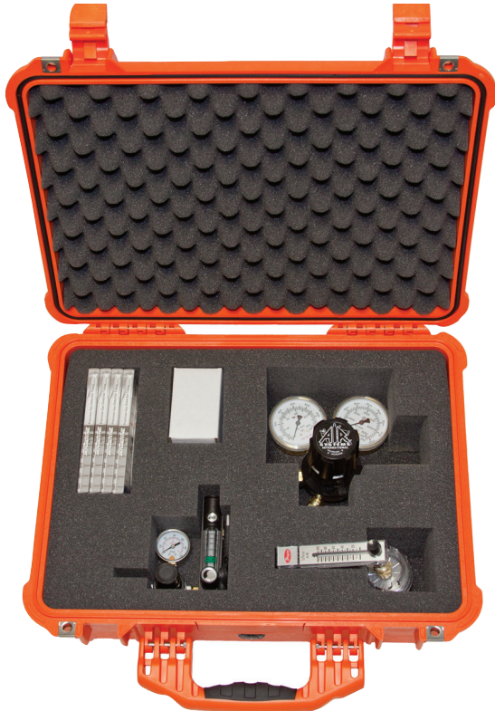
Air Quality Test Kit LP/HPA445K

Air Systems' breathing air quality test kits are designed to test the air produced by low pressure compressors (use model LP-A4) and compressed high pressure air in cylinders (use models HP-A4 or HP-A445). The tests are accomplished through the use of low cost detector tubes that provide a "go/no go" test of the air quality. If a high reading is found, this signals the user that they have a potentially unacceptable quality of breathing air. If this occurs, a laboratory analysis of the air components must be made to determine the exact readings of the air quality and take corrective action.